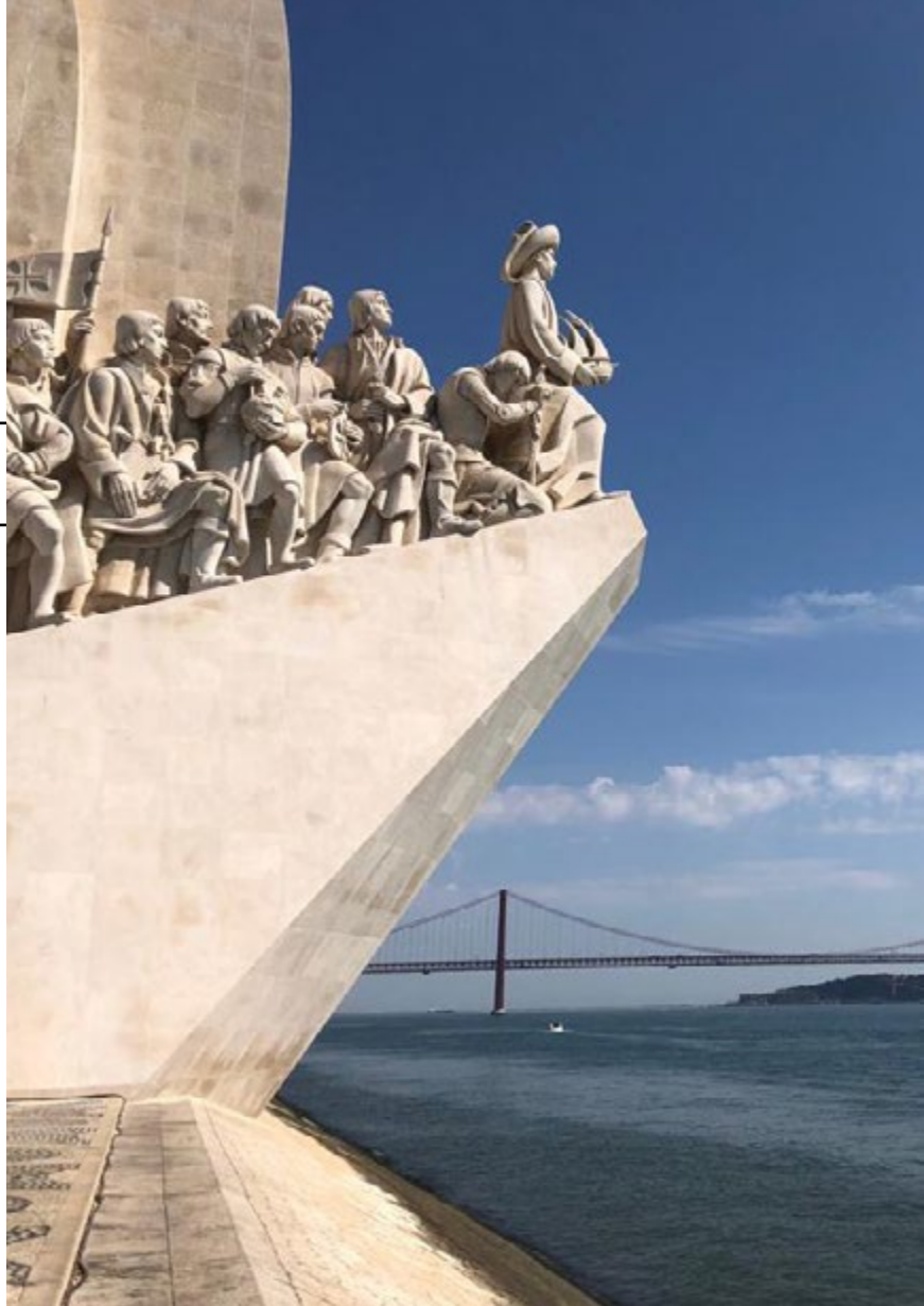
Monument to the Discoveries | Lisbon

On top of that, Lisbon, the economic center of Portugal, has established itself as the new location of the digital world and has been the location of the biggest internet technology conference worldwide, the so-called "Web Summit", since 2016.